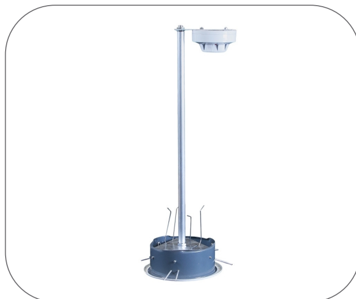
Void Fire Detector Holder